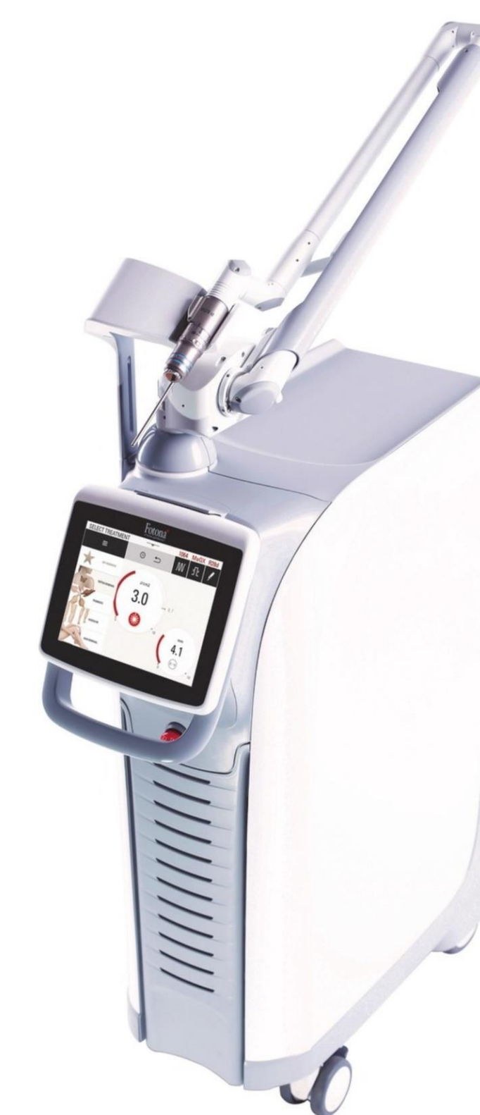
StarWalker ® MaQX Laser System

All parties involved worked with the target dates in mind and the first patient started treatment on time at the end of 2020.